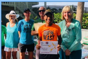
MORGAN WOODSON FITNESS STAR